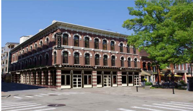
THE OLIVER HOTEL – GROUND FLOOR